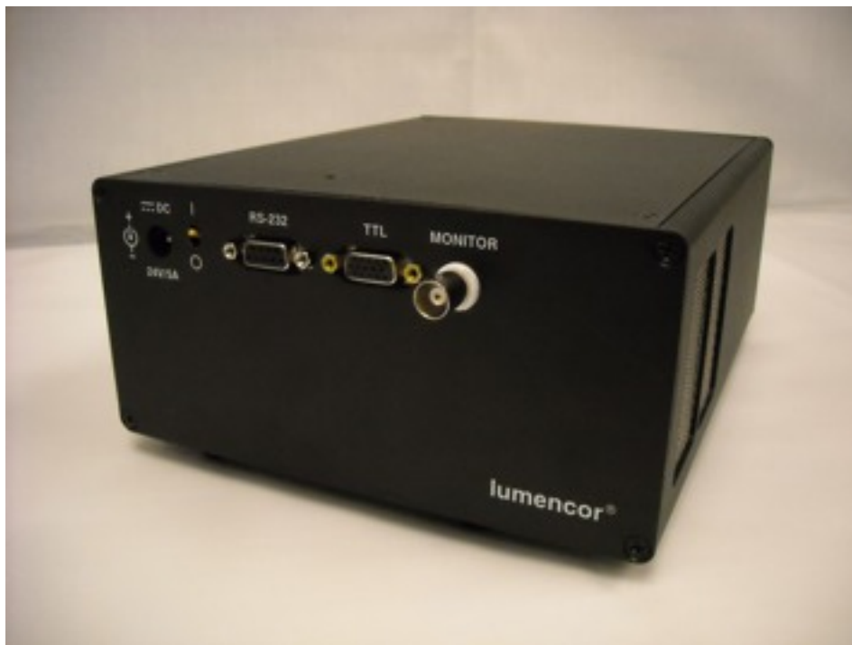
Rear Panel of AURA light engine

The AURA can either be controlled by a Lumencor supplied GUI via a RS-232 port or by 3 rd party laboratory software via the TTL port. The GUI provides a quick and easy way to control your new light engine. You will have the ability to turn each source within the unit on/off, adjust the power of each source independently from off to full power, switch between the GREEN and YELLOW excitation filters and also cycle through all sources automatically at a frequency chosen by the user. Refer to the photo below of the rear panel for location of the various connectors.